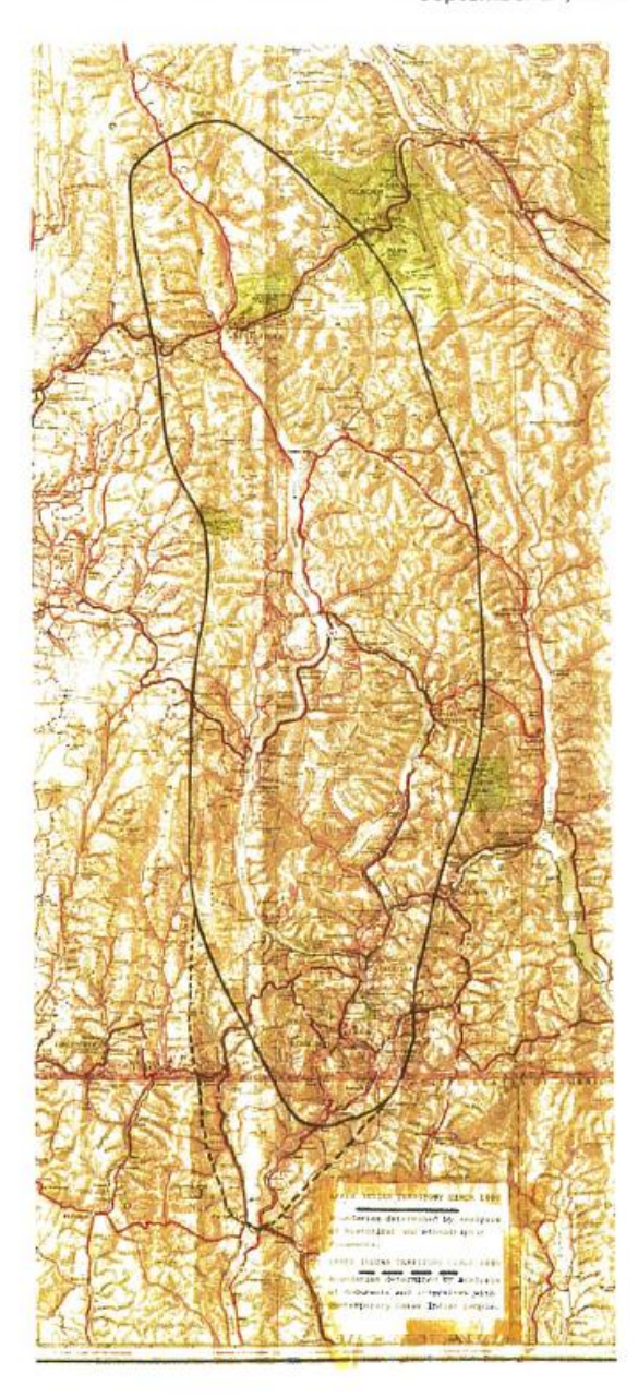
Figure 33: "Lakes Indian Territory, circa 1800 [and] circa 1880]." Map includes the Slocan within traditional Lakes (Sinixt) territory. The solid-line boundary c. 1800 is based on analysis of historical and ethnographic documents; the dotted-line boundary c. 1880 is based on document analysis as well as interviews with Native consultants in the 1970s-1980s